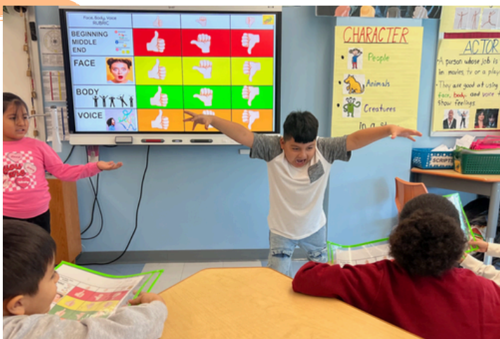
A Second grade storyteller and actor telling a story with a beginning, middle and end to be scored by the class.

After rehearsing in small groups, students perform for the entire class. The audience then uses the rubric to score the performance and provide constructive feedback. This process helps us refine our skills and become confident, thoughtful performers!