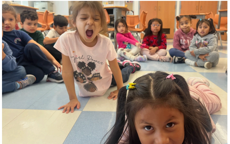
Kindergartners pretending to be snakes slithering through the dark forest.

We've also been discovering how much better our acting becomes when we use all three parts of our acting tools—face, body, and voice—when compared to just one or two. Our young actors are doing a fantastic job transforming into incredible characters!